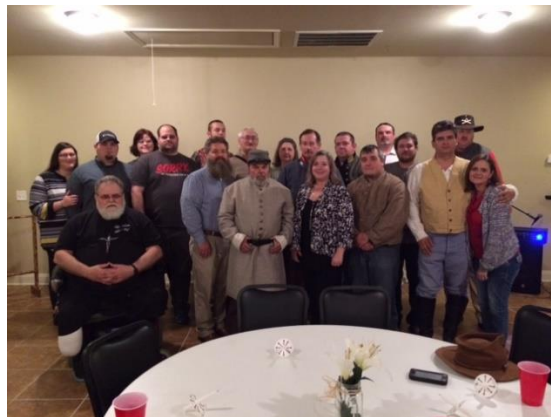
Photo of all of the attendees to the second annual Lee-Jackson Banquet.