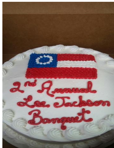
A photo of the cake for the Lee-Jackson Banquet paid for by the Camp which has a first National Flag on it.